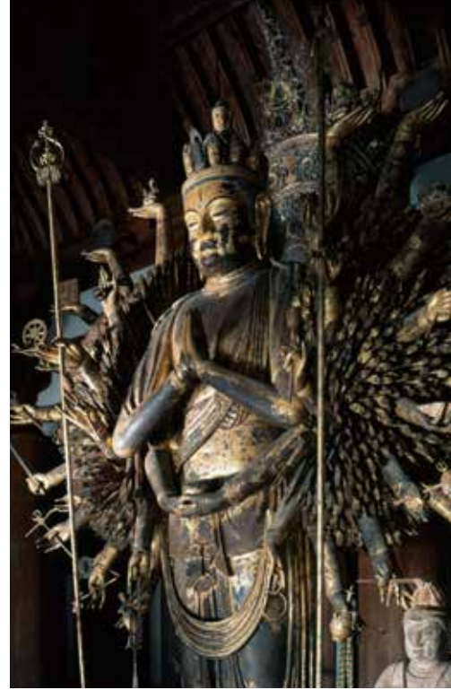
Thousand-hand Kannon Standing Statue (National Treasure)

¥ When the Genjo Sanzoin Garan is opened : 1100 yen, When the Genjo Sanzoin Garan is closed : 800 yen. *1 & *2: An additional 500 yen is necessary to enter each place.