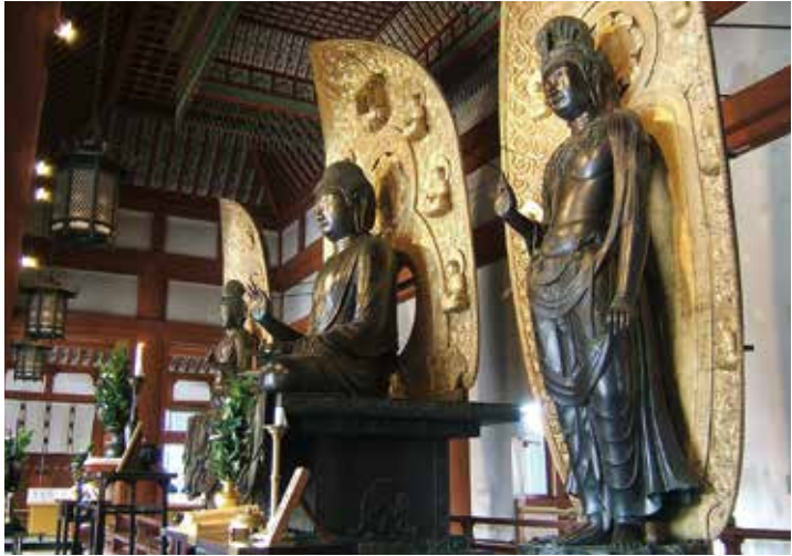
Yakushi Sanzon (Main Image) (National Treasures)

Yakushiji Temple Hakuho Garan