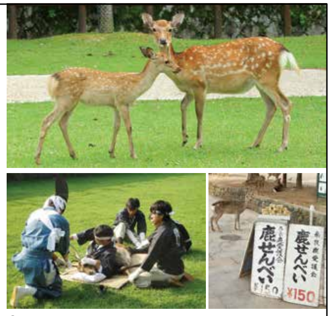
Deer Antler Cutting

October is the time for the annual "Tsuno-kiri," or deer's antler cutting event. The ritual has continued for about 340 years and is one of the autumn highlights of Nara. The male deer with big antlers are gathered into the field surrounded by a fence and their antlers are ritually cut using saw- it's such an energetic and exciting event. By the way, antlers for deer are like nails of human beings, therefore, deer experience no pain while their antlers are cut. The Nara Deer Preservation Foundation sells the cut antlers and the revenue will be utilized for the further protection of deer in Nara.